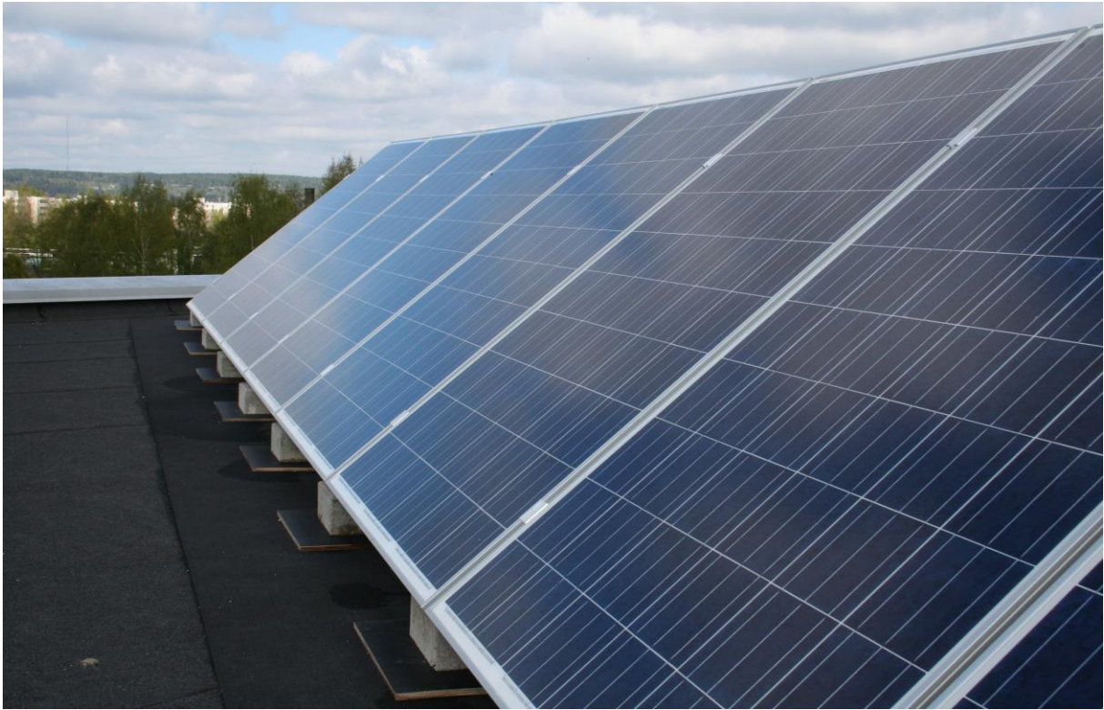
Figure 2: The first panel string installed