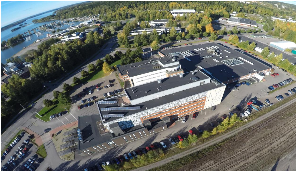
Figure 3: The “bird’s eye” view of the location