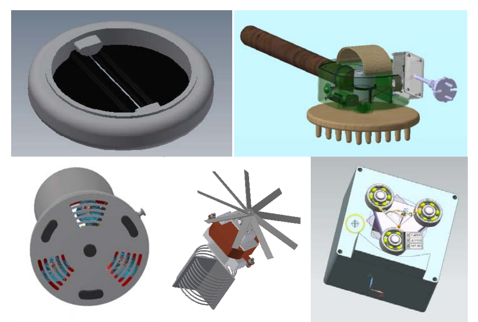
Figure 3. Some case studies and preliminary results from students' designs. a) Instrumented heart valve. b) Automatic sponge. c) Umbrella dryer. d) CAD of a peristaltic pump.

Among already detected positive results, it is very important to highlight the following aspects, which we believe are intrinsically connected with a well implemented CDIO framework within the Master's Degree in Industrial Engineering and with successful PBL subjects: